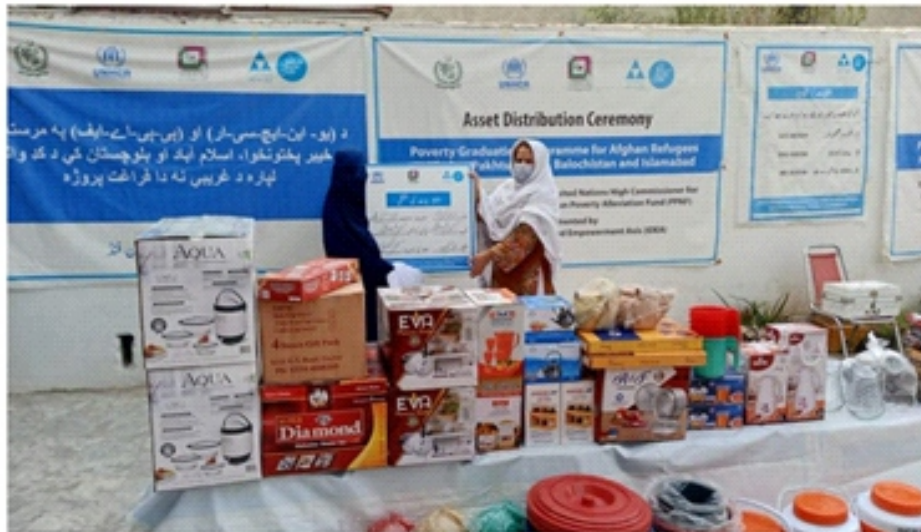
A female Afghan refugee receives a productive livelihood asset in this image on November 11m 2023.

Islamabad: The Pakistan Poverty Alleviation Fund (PPAF) has embarked upon the distribution of productive livelihood assets to Afghan refugee families under the UNHCR-funded Poverty Graduation Programme (PGP) for Afghan Refugees.