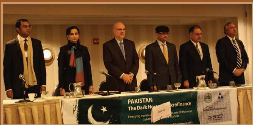
PPAF attends SEEP Conference

... international organizations, multilateral agencies, civil society organizations, media and governments to share the PPAF story and to explore opportunities for forging alliances and building partnerships. To see our international activities during the year, please see: www.ppaf.org.pk/international-outreach