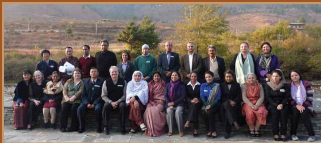
PPAF attends a summit in Bhutan